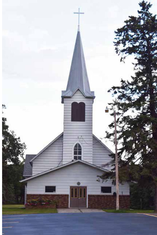
St. Joseph's Church 2312 222nd Ave Beaulieu, MN 56557

Our parish Family has 297 registered families with over 750 individuals. Your sacrificial gifts of time, talent and treasure help "spread the Good News" of the Gospel. Thank you!