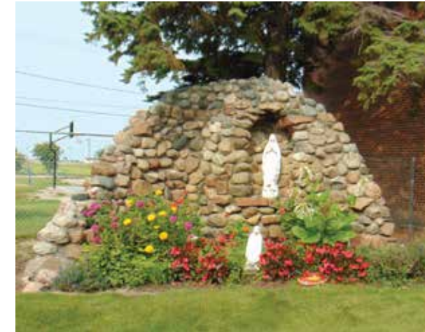
St. Michael's School 501 1st St. SW Mahnomen, MN 56557

St. Michael's School has the capacity to educate 75 children. We have a variety of scholarships available through the generosity of many donors which helps to subsidize yearly tuition costs. Children who attend St. Michael's School get a more individualized education, with faith at the center of their curriculum. St. Michael's School has been educating children for 90 years.