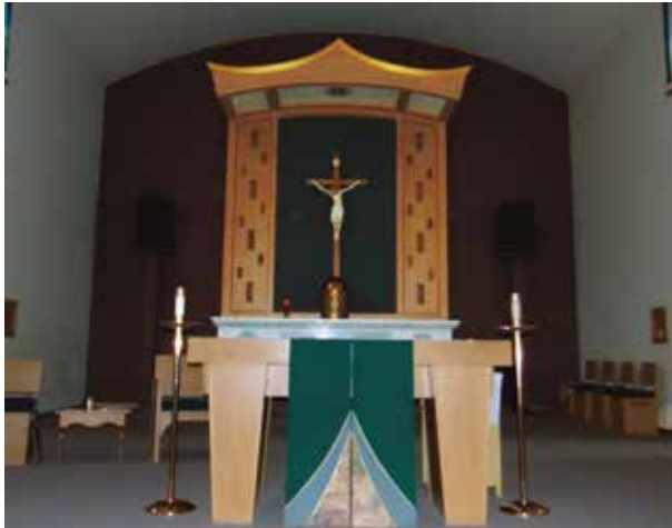
St. Michael's Church 501 S. Main St. Mahnomen, MN 56557

Our parish Family has 297 registered families with over 750 individuals. Your sacrificial gifts of time, talent and treasure help "spread the Good News" of the Gospel. Thank you!